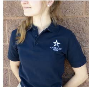
POLO WITH STAR LOGO $15