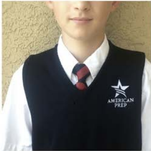
VEST W/WHITE STAR LOGO $25