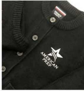
ROUND NECK CARDIGAN $30