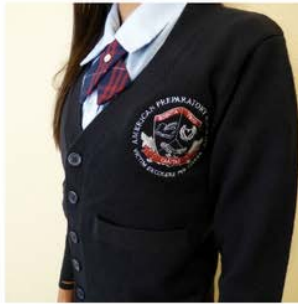
CARDIGAN W/CREST LOGO