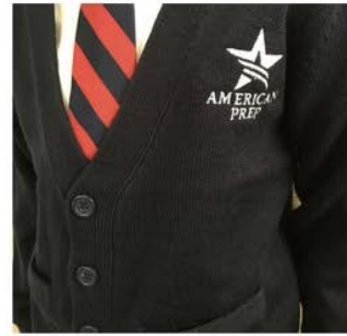
V-NECK CARDIGAN W/ STAR LOGO $30