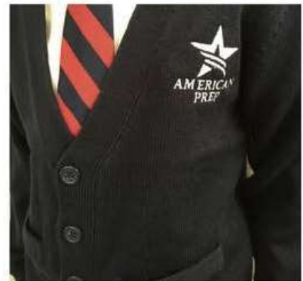
V-NECK CARDIGAN W/ STAR LOGO $30