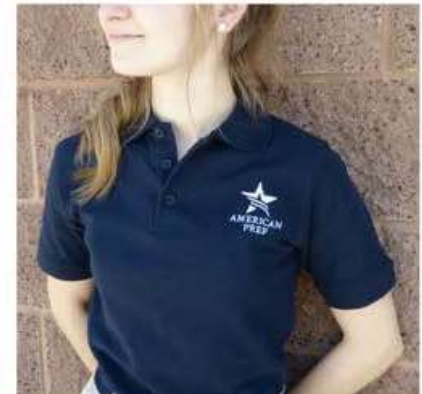
POLO WITH STAR LOGO $15