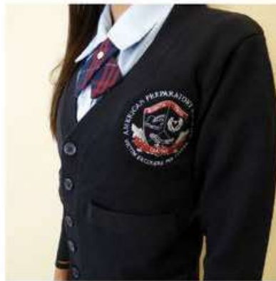
CARDIGAN W/CREST LOGO