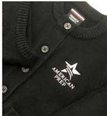
ROUND NECK CARDIGAN $30