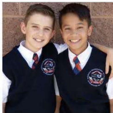
VEST W/ CREST LOGO $25