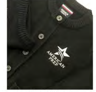
ROUND NECK CARDIGAN $30 Girls K-3