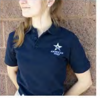
POLO WITH STAR LOGO $15 All Students