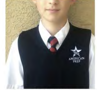
VEST W/WHITE STAR LOGO $25 K-6