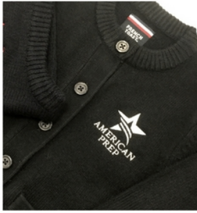
ROUND NECK CARDIGAN $30