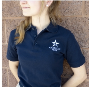
POLO WITH STAR LOGO $15