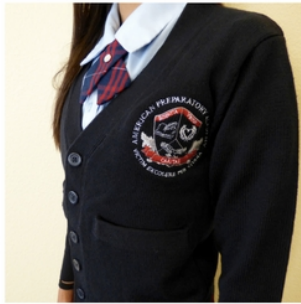
CARDIGAN W/CREST LOGO