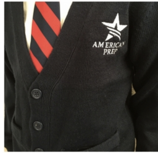
V-NECK CARDIGAN W/ STAR LOGO $30