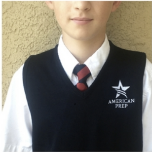
VEST W/WHITE STAR LOGO $25