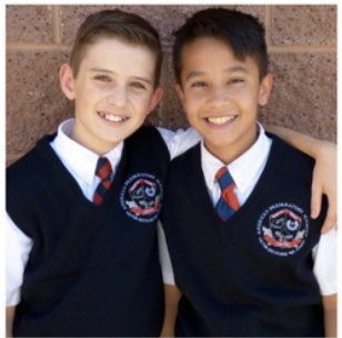
VEST W/ CREST LOGO $25